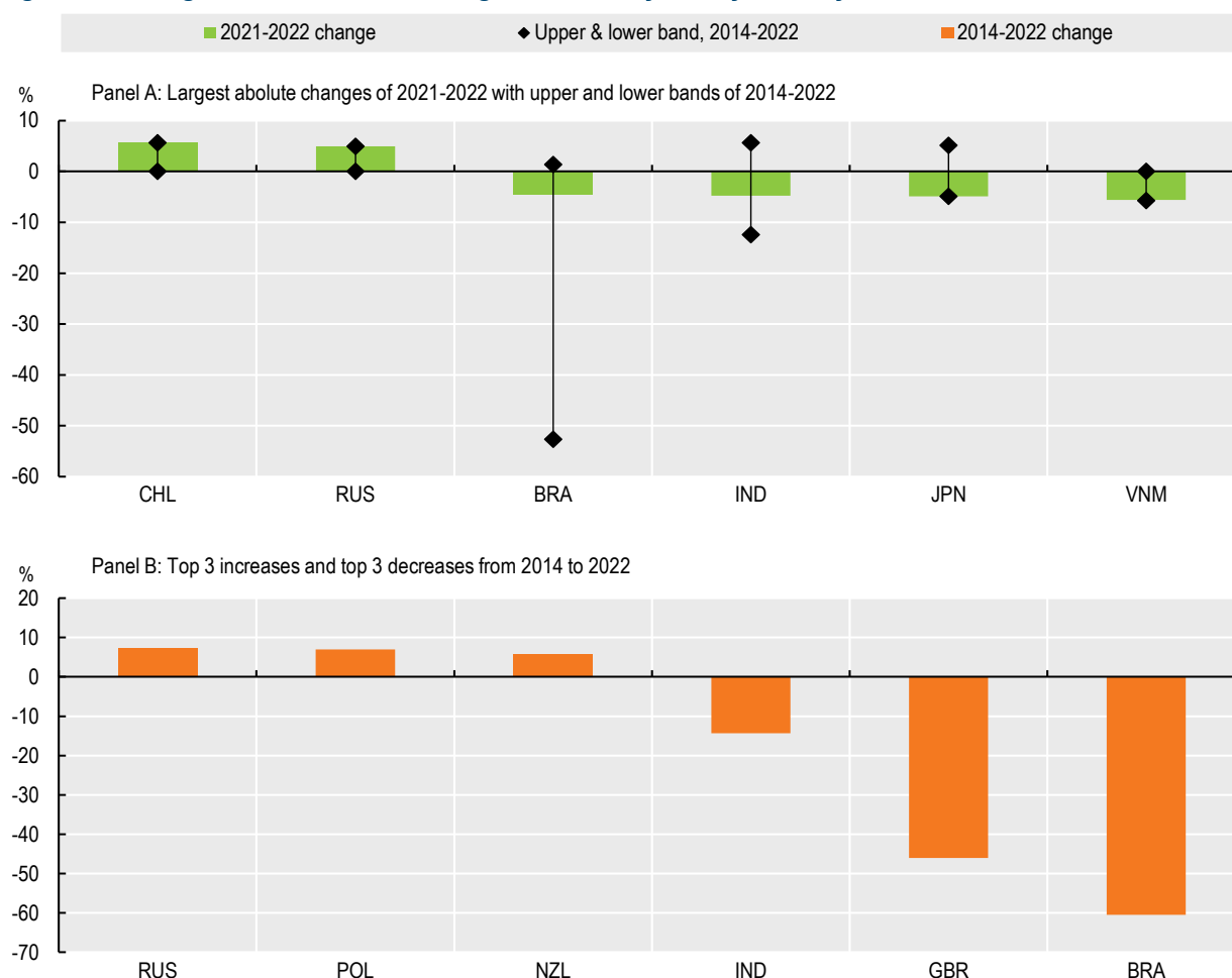
Figure 2. Change since 2014 and change in the last year, by country

Note: Selection criteria for Panel A was based on largest absolute changes since 2021. Panel B selection is the 3 largest increases, and the 3 largest decreases in the STRI since 2014.