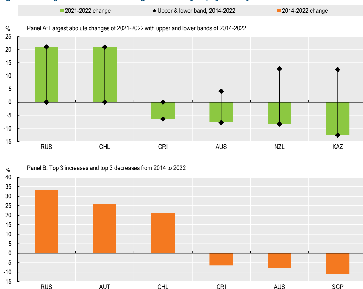
Figure 2. Change since 2014 and change in the last year, by country

Note: Selection criteria for Panel A was based on largest absolute changes since 2021. Panel B selection is the 3 largest increases, and the 3 largest decreases in the STRI since 2014.