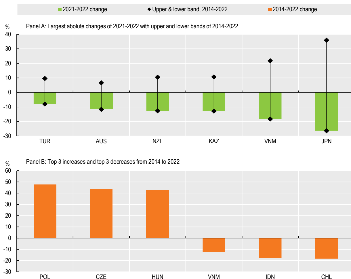
Figure 2. Change since 2014 and change in the last year, by country

Note: Selection criteria for Panel A was based on largest absolute changes since 2020. Panel B selection is the 3 largest increases, and the 3 largest decreases in the STRI since 2014.