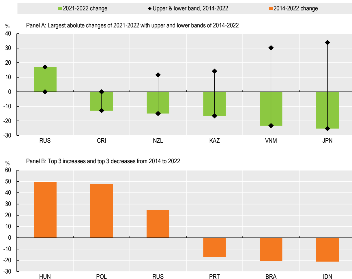
Figure 2. Change since 2014 and change in the last year, by country

Note: Selection criteria for Panel A was based on largest absolute changes since 2020. Panel B selection is the 3 largest increases, and the 3 largest decreases in the STRI since 2014.