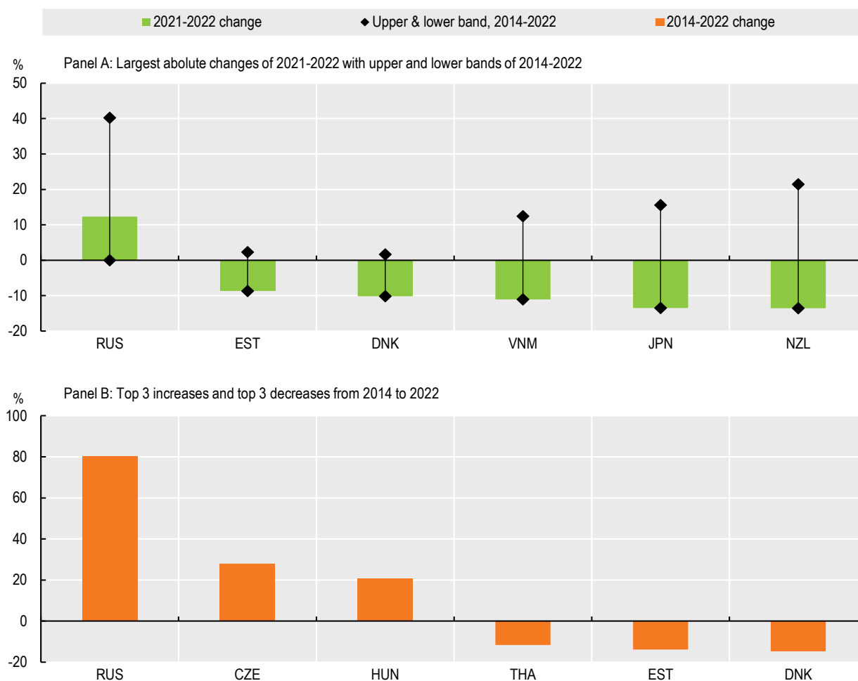
Figure 2. Change since 2014 and change in the last year, by country

Note: Selection criteria for Panel A was based on largest absolute changes since 2020. Panel B selection is the 3 largest increases, and the 3 largest decreases in the STRI since 2014.