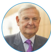
Francois-Xavier de Donnea

The SWAC Forum will focus on the future of the Saharo-Sahelian zones, object of serious concerns. We are relieved that the international community is mobilising around this formidable issue. This includes the recent approval of the United Nations Integrated Strategy for the Sahel and the EU's commitment through its Strategy for Development and Security in the Sahel; strong initiatives undertaken by the World Bank and the African Development Bank; and the flagging of the Sahel as a priority in a number of bilateral programmes. This remarkable mobilisation supports the programmes and strategies of the concerned countries as well as of their regional organisations – ECOWAS,