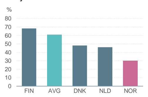
Fig. 1. Norwegians less likely to feel ignored by government than people in all other countries surveyed

Note: Percent that disagree (or strongly disagree) with the statement "I feel the government incorporates the views of people like me when designing or reforming public benefits."