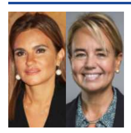
The Co-chairs of the Women's Economic Empowerment Forum: H.E. Sahar Nasr, Minister of Investment and International Co-operation, Egypt (left) and H.E. Marie-Claire Swärd Capra, Ambassador of Sweden to Algeria (right).