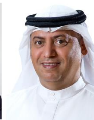
H.E. Obaid Al Zaabi