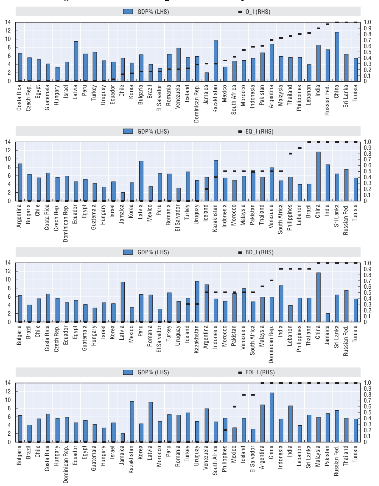
Figure 2. Annual real GDP growth rate and capital control indices

Note: All figures are averaged over the period 2003-09.