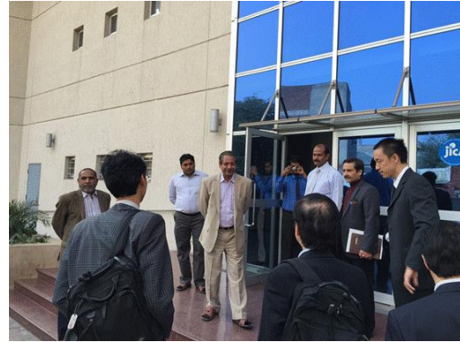
Greeting college officials at the entrance

Box: ODA loan: Irrigation system improvement project, Punjab Province