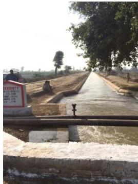
Irrigation system built with Japanese assistance