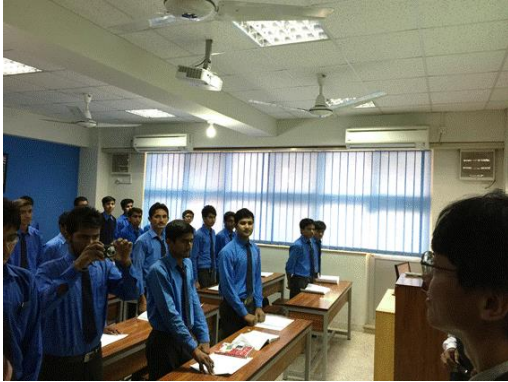
Students in uniform for classes