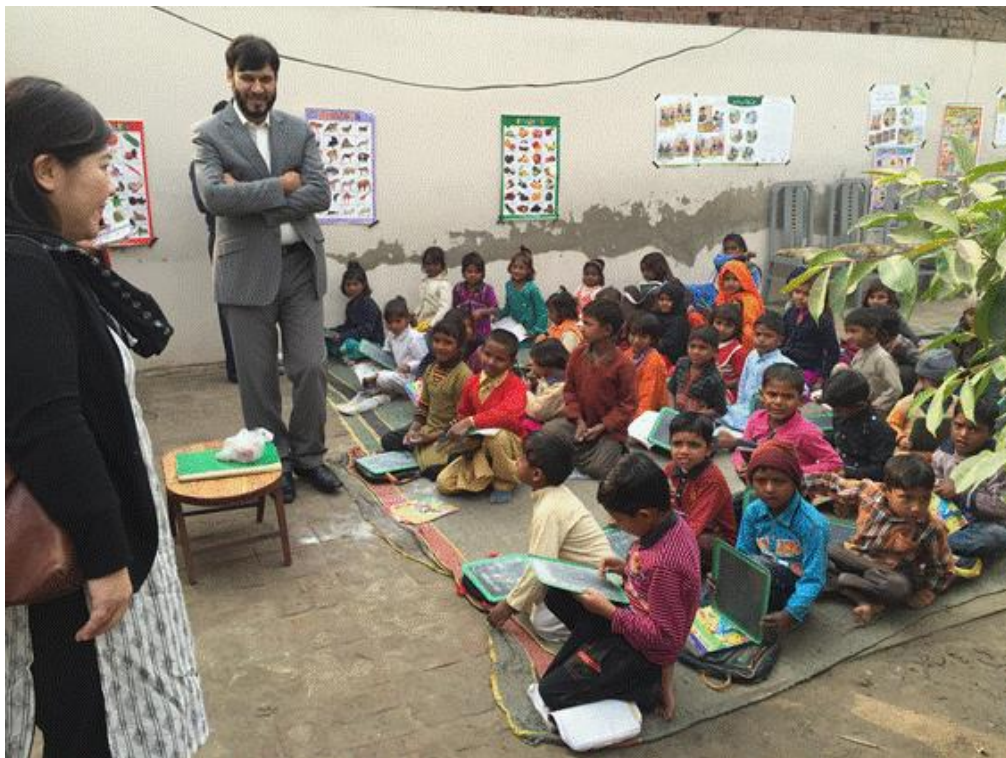
Village children participate in a project to promote non-formal education in Punjab Province based on technical cooperation.