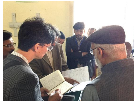
Officials explaining the utilization situation of the irrigation system