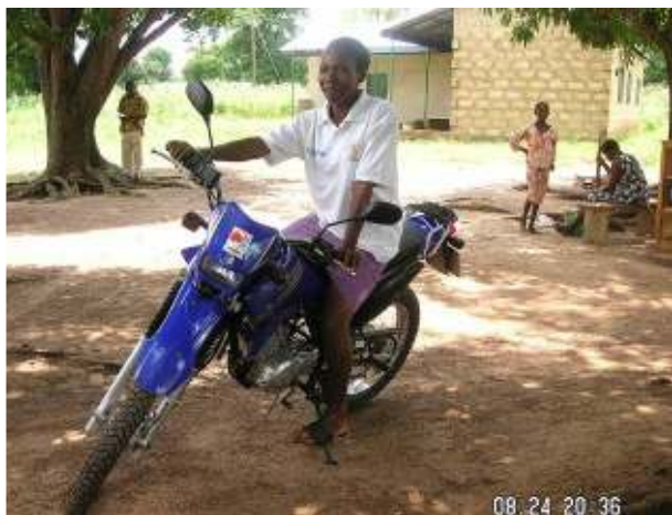
Community Health Officer trained by the Program for the Improvement of Health Status of People Living in Upper West Region