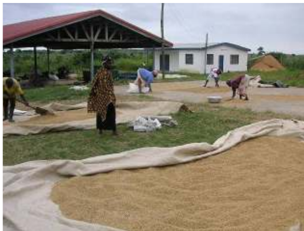
Farmer organization supported by irrigated agriculture projects in Okyereko