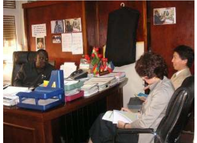
Interview with the Director, External Resource Mobilization-Bilateral Division at the Ministry of Finance and Economic Planning