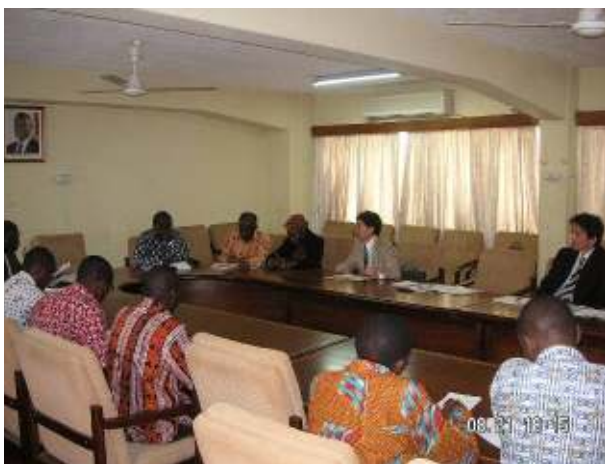
Interview with officers of the SME and TEC at the Ministry of Trade and Industry