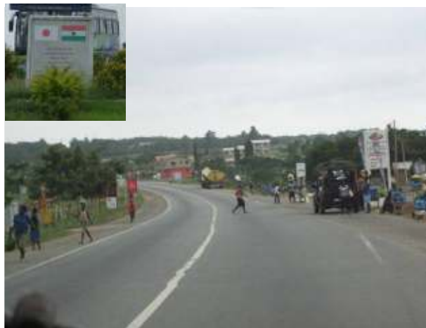
National Trunk Road N1 with the monumental stone