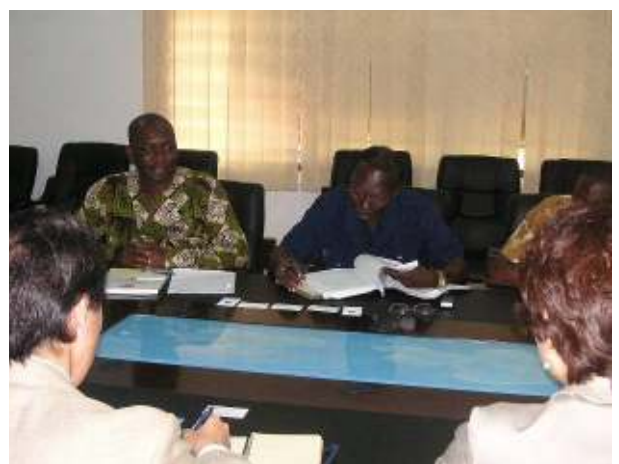
Interview at the National Development Planning Commission