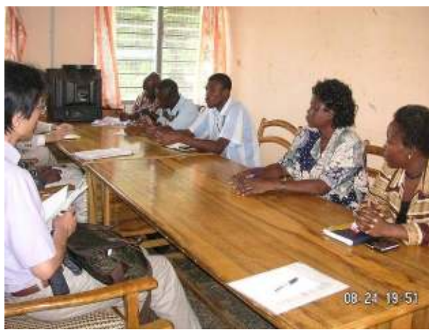
Interview with officers of Ghana Health Service in Jirapa District, from the Program for the Improvement of Health Status of People Living in Upper West Region