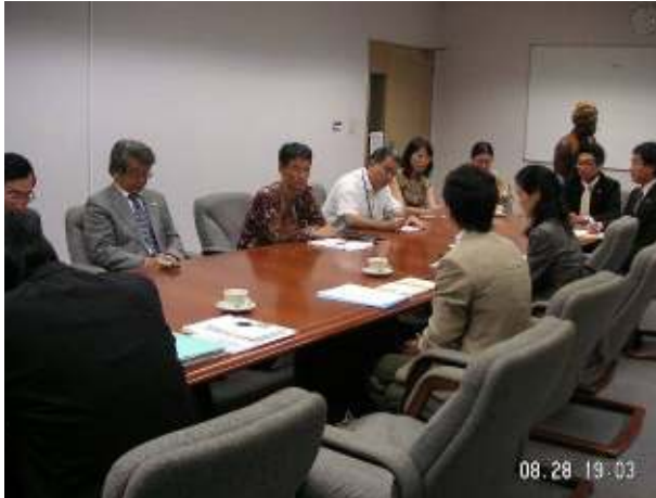
Meeting with the Japan's ODA Task Force in Ghana