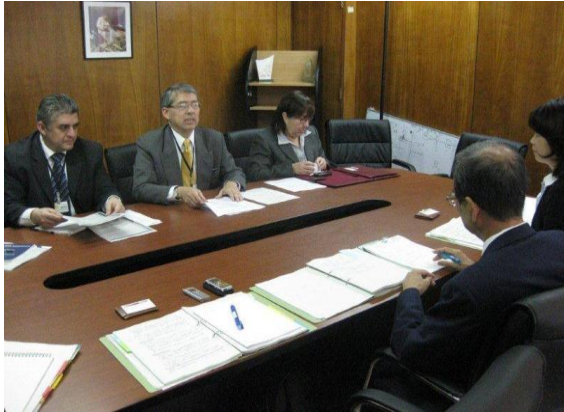
Interview with APCI