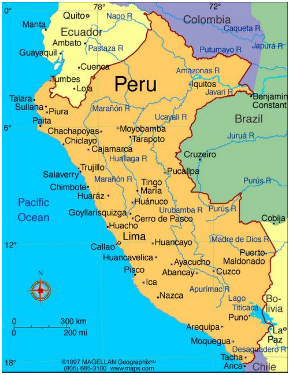
Map of Peru