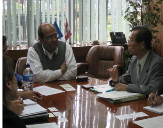
Interview with the Ministry of Energy and Mining