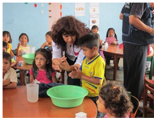
Health education at kindergarten (Technical cooperation project)