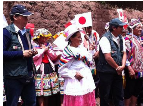
Farmers welcome the survey team

In addition, the Asociacion Peruano Japonesa launched a series of campaigns called “Together with Japan” immediately after the March 11 earthquake, and conducted “Gambare Nippon,” a support event by the Japanese Peruvian society in which eight groups of young Japanese Peruvian musicians danced Eisa ,