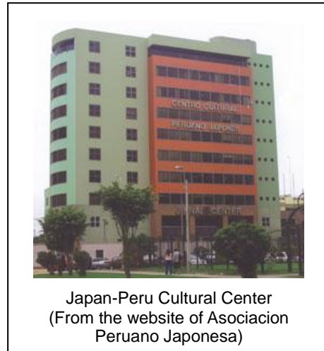
Japan-Peru Cultural Center

Diplomatic relations resumed in 1952 and Peru promulgated a regulation to return the assets confiscated during the war to the Japanese immigrants in 1954. In 1964, the Government of Peru supplied 10,000 hectare of land as compensation for six Japanese schools confiscated during the war. The Japan-Peru Cultural Center built on this land has a multi-purpose hall, Japanese restaurant and the archives of Japanese immigration, and is a hub for the Japanese Peruvians' social and cultural activities. In June 2011, then-President Garcia apologized for his country's illegal internment and deportation of Japanese immigrants during World War II.