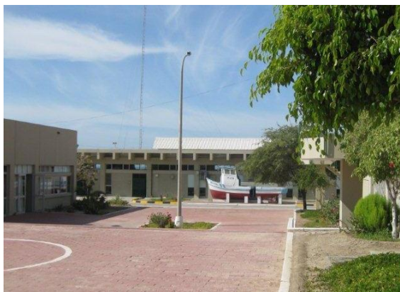
FONDEPES Paíta Branch (Technical cooperation project)