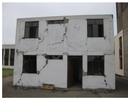
A house for seismic testing on the premise of CISMID (Technical cooperation project)