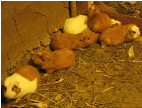
Cui, a protein source in mountainous areas (Loan aid project)