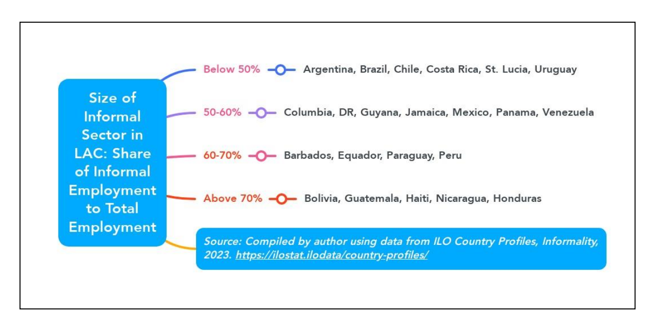
Chart 1: Employment in the informal Sector as a percentage of total employment

Chart 1 below provides a snapshot of the size of the informal sector in LAC.