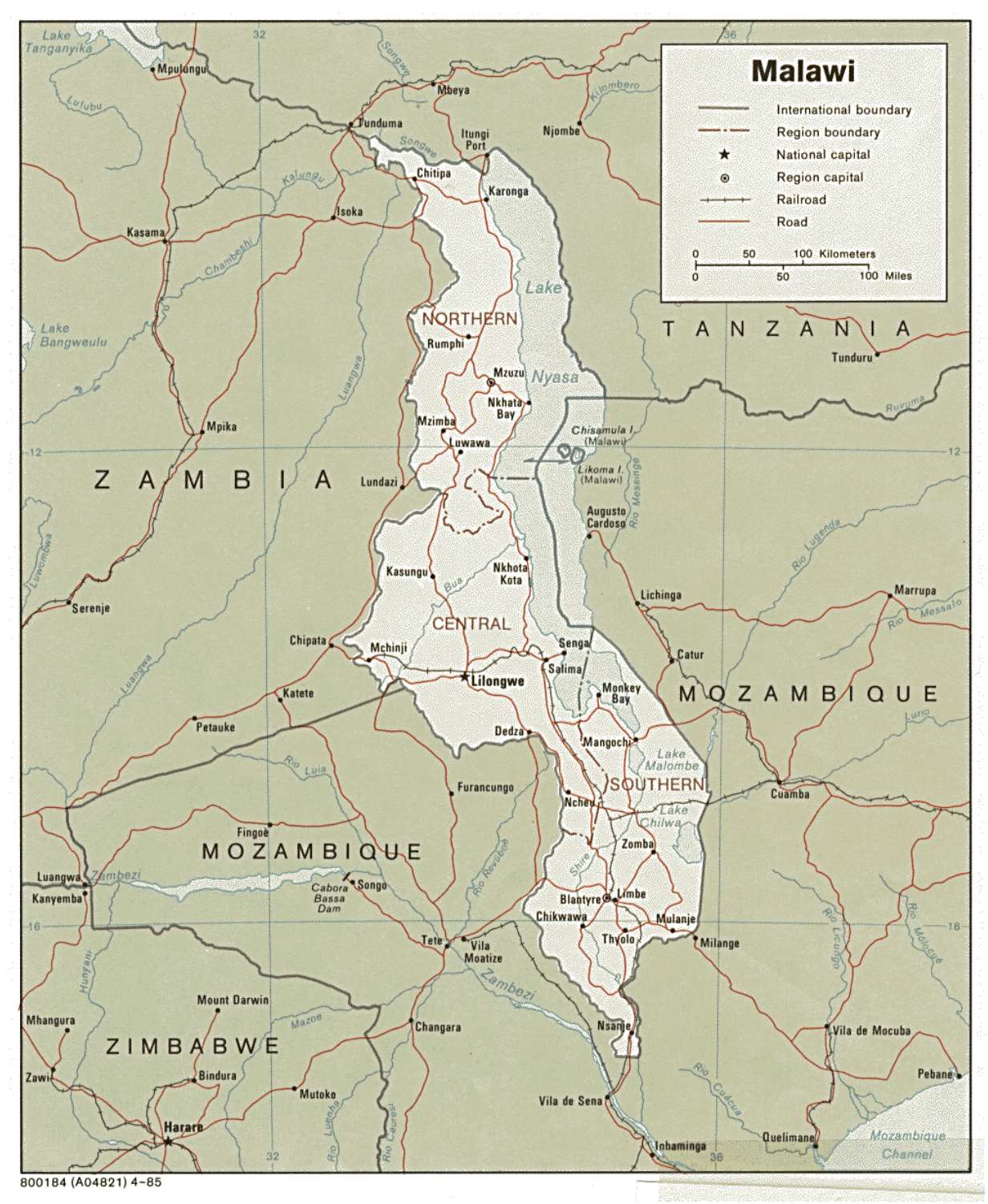
Figure 1: Map of Malawi