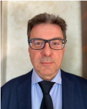
Giancarlo Giorgetti Minister of Economy and Finance, Italy