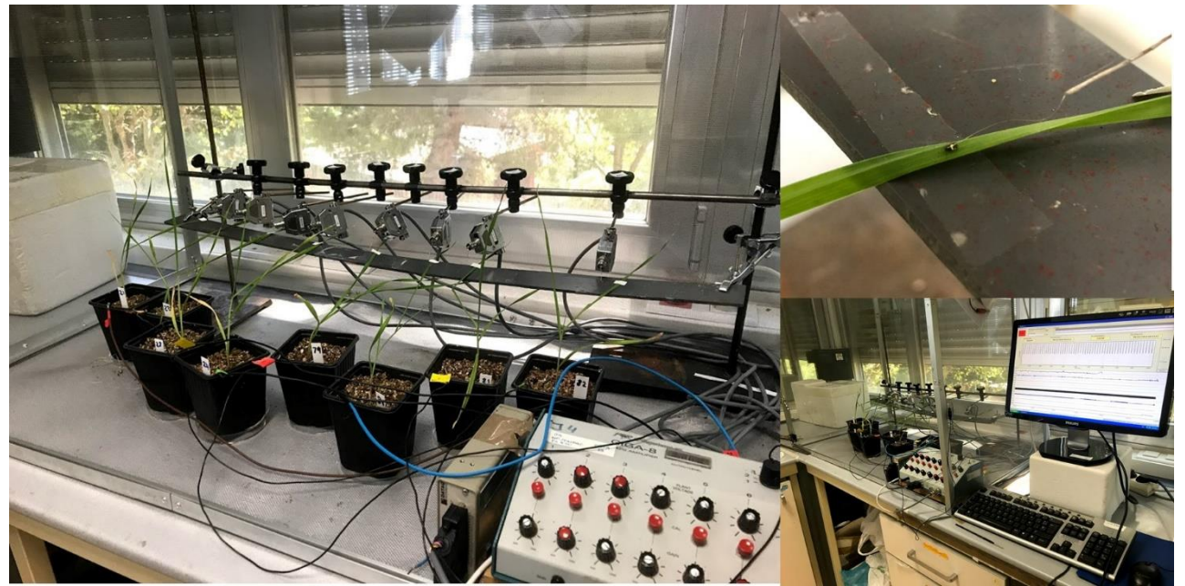
Figure 2. Electrical penetration graphs to quantify aphid behaviour on a range of host plant phenotypes.