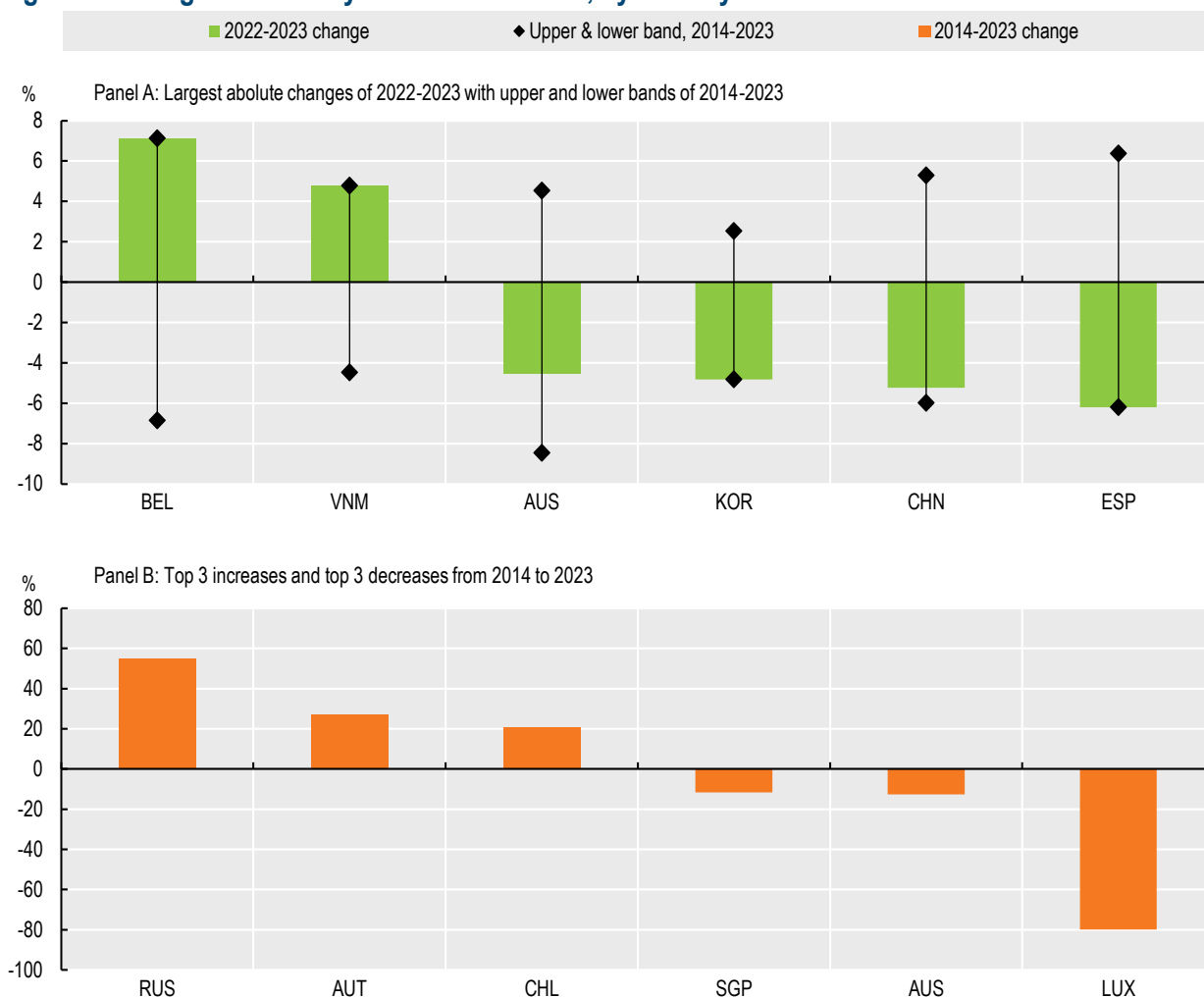
Figure 2. Change in the last year and since 2014, by country

Note: Selection criteria for Panel A were based on largest absolute changes since 2022. Panel B selection is the 3 largest increases, and the 3 largest decreases in the STRI since 2014.