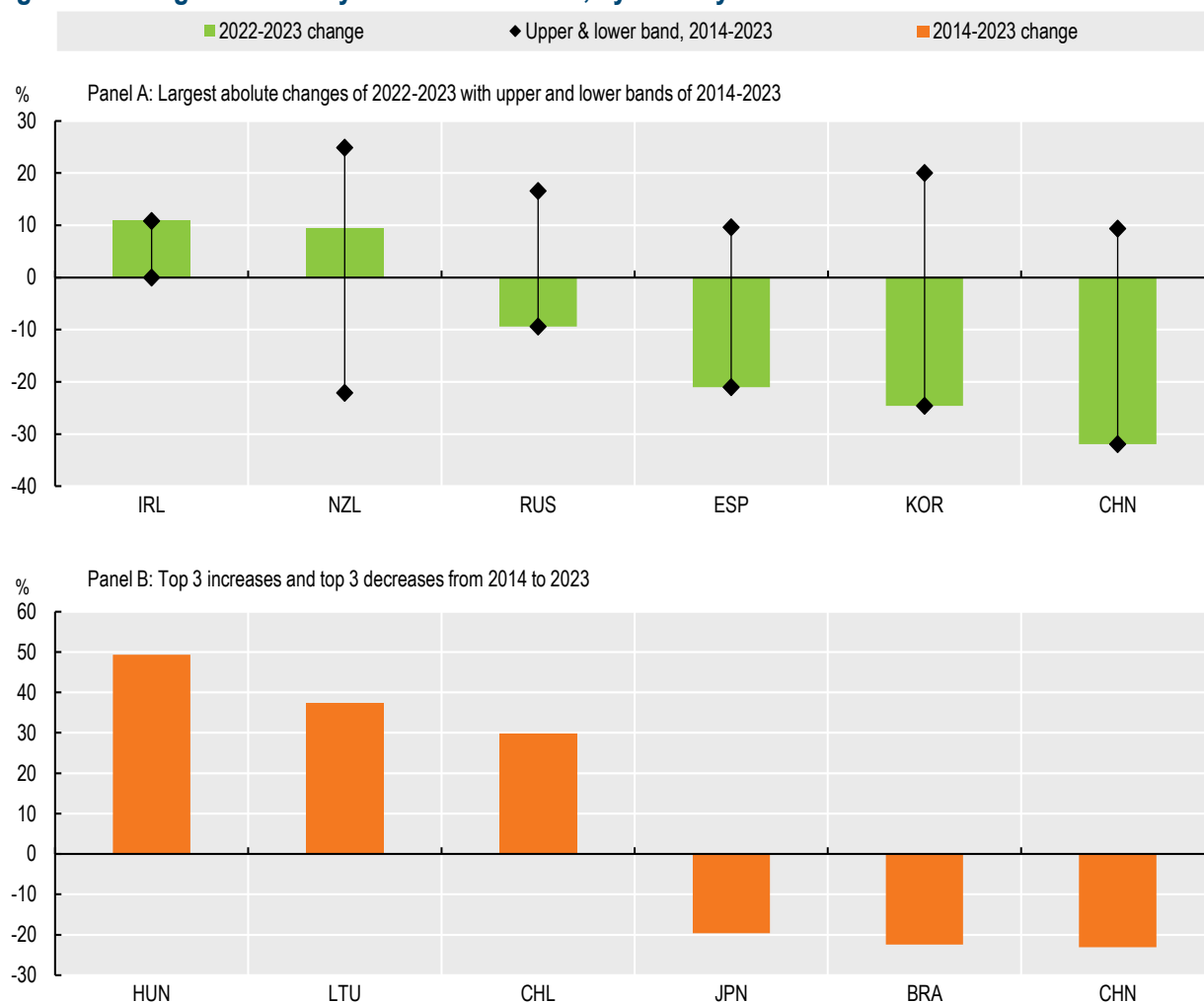
Figure 2. Change in the last year and since 2014, by country

Note: Selection criteria for Panel A were based on largest absolute changes since 2022. Panel B selection is the 3 largest increases, and the 3 largest decreases in the STRI since 2014.