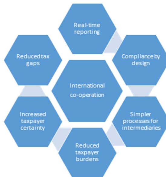
Figure 2. How the international information exchange architecture could evolve

69. The following sections explore how the international information exchange architecture could evolve, with a view to improving timeliness through real-time reporting and incorporating compliance by design features. This would complement, and align with, the wider trends in tax administration and is expected to ultimately lead to simpler processes for intermediaries, reduced compliance burdens for taxpayers and increased tax certainty, while reducing the tax gap for governments.