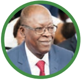
Abdoulaye BIO TCHANÉ

Minister of State for Planning and Development, Benin