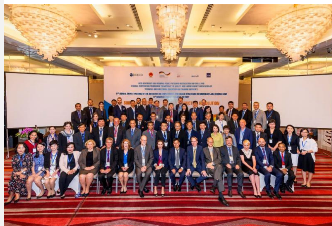
📍 Delegates at the 2017 RPN on Education and Skills, Viet Nam.