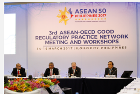
📍 Third Regional Policy Network Meeting on Good Regulatory Practice, held in Iloilo City, Philippines, in 14-16 March 2017.