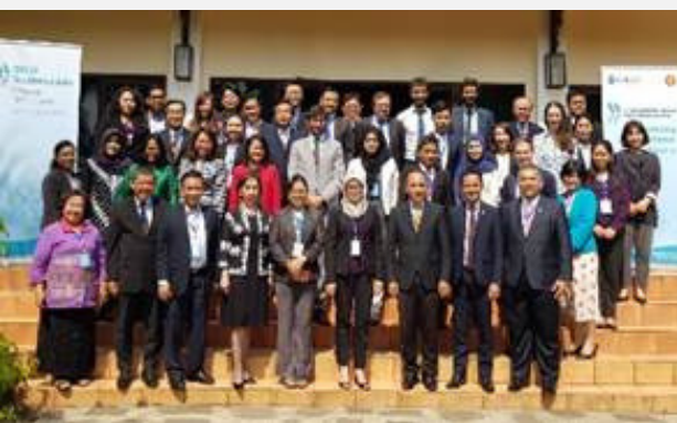
⌚ Ninth Regional Policy Network Meeting on SMEs, held in Luang Prabang, Lao PDR, in April 2018