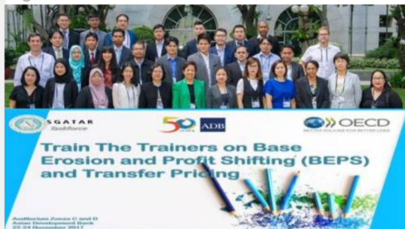
⌚ Train the Trainers Seminar in Manila on 22-24 November 2017