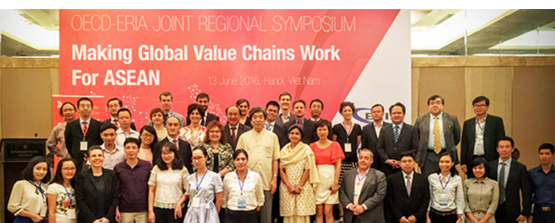
🕒 OECD-ERIA Seminar on Making GVCs work for ASEAN in June 2016, Hanoi, Viet Nam.