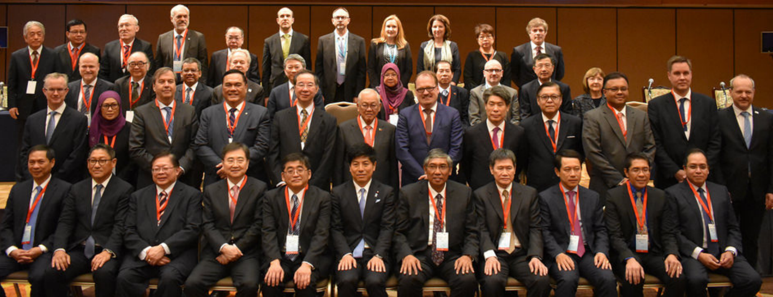
⌚ Ministers and high-level representatives from Southeast Asia at the First Ministerial Meeting of the OECD Southeast Asian Regional Programme, in Tokyo on 8-9 March 2018.