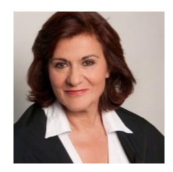
Ms. Theano Fotiou Alternate Minister of Labour, Social Security and Social Solidarity @TheanoFotiou

She was one of the first to participate in the movement of the assistant and associates, which changed the Greek universities and actively participated in all the movements against the privatization of the Greek universities.