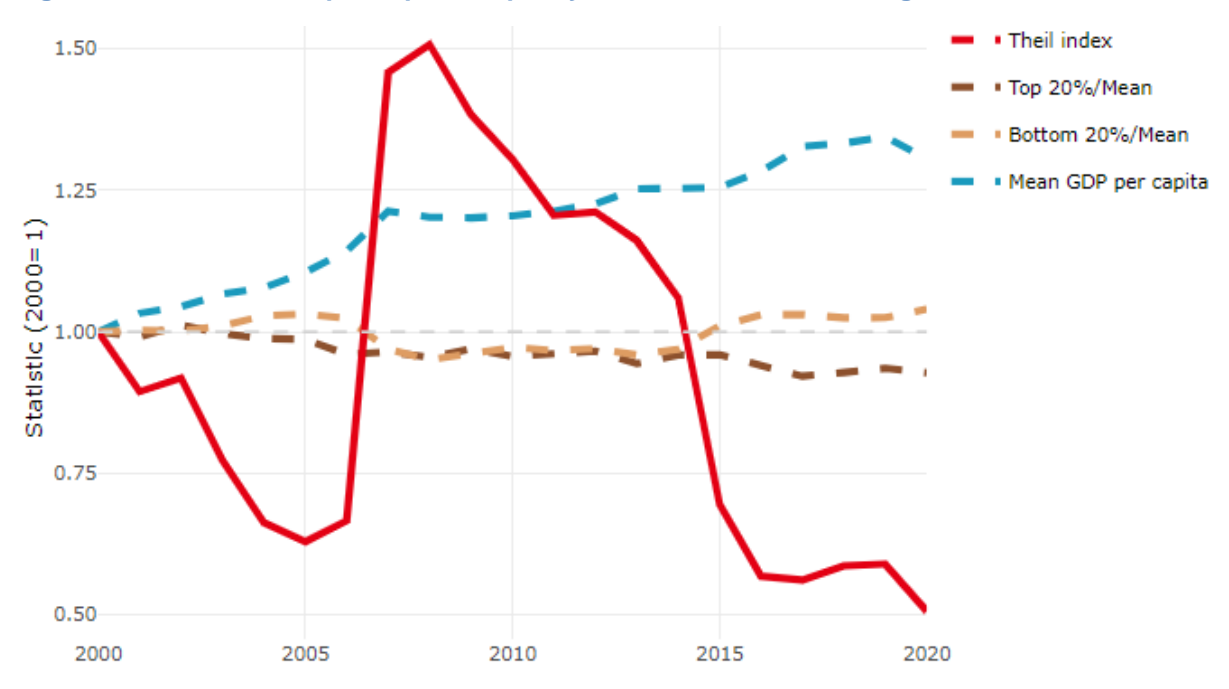
Figure 1. Trends in GDP per capita inequality indicators, TL3 OECD regions

The Top 20%/Mean ratio was 0.072 lower in 2020 compared to 2000, indicating decreased polarisation. The Bottom 20%/Mean ratio was 0.04 higher in the same period, indicating bottom convergence.