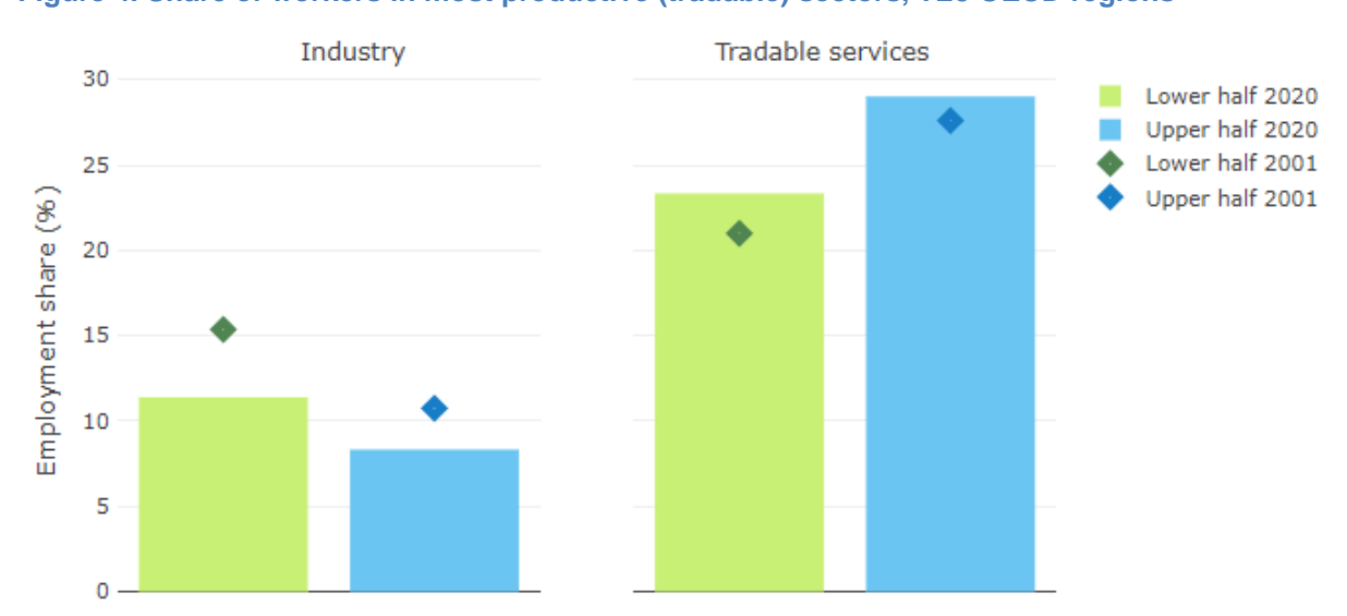
Figure 4. Share of workers in most productive (tradable) sectors, TL3 OECD regions

Regions where the economic activity shifts towards tradable activities, such as industry and tradable services, tend to grow faster in terms of labour productivity. In the Netherlands, between 2001 and 2020, the share of workers in the industrial sector went down in all regions but more so in regions that were already in the lower half of the labour productivity distribution. At the same time, the share of workers in the tradable services sector went up in all regions but more so in regions that used to be in the lower half of the labour productivity distribution. Hence, the evolution of employment shares in the industrial sector widened the labour productivity gap between regions while the opposite was true for tradable services.