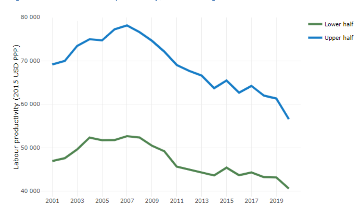
Figure 3. Evolution of labour productivity, TL3 OECD regions

In Greece, the gap between the upper and the lower half of regions in terms of labour productivity decreased between 2001 and 2019. Over this period labour productivity in the upper half of regions declined roughly by 11%, while it declined only by 8% in the lower half of regions. During 2020, the gap continued to narrow. Nevertheless, more years of data are necessary to determine the long-term impact of the COVID-19 pandemic on labour productivity gaps in regions.