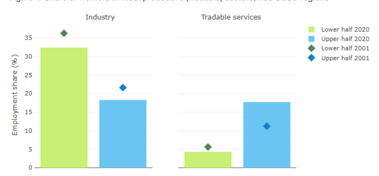
Figure 4. Share of workers in most productive (tradable) sectors, TL3 OECD regions

Regions where the economic activity shifts towards tradable activities, such as industry and tradable services, tend to grow faster in terms of labour productivity. In Estonia, between 2001 and 2020, the share of workers in the industrial sector went down in all regions but more so in regions that were already in the lower half of the labour productivity distribution. At the same time, the share of workers in the tradable services sector went up in regions already located in the upper half of the labour productivity distribution while it went down in regions located in the lower half. Hence, the evolution of employment shares both in the industrial and in the tradable services sectors widened the labour productivity gap between regions.