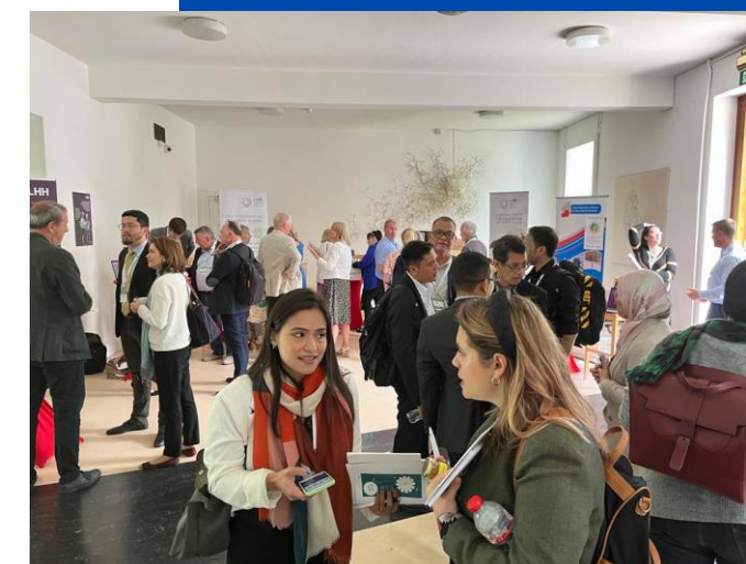
Networking at the Local Initiatives Marketplace