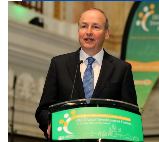
Opening keynote from Micheál Martin, Taoiseach (Prime Minister) of Ireland