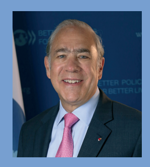
Angel Gurría Secretary-General of the OECD

"The OECD's Framework for Policy Action on Inclusive Growth will help countries implement policies that give all people, firms and regions the chance to thrive."