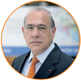
Ángel Gurría Secretary-General OCDE

As Secretary-General of the Organisation of Economic Co-operation and Development (OECD) since 2006, Angel Gurría has firmly established the Organisation as a pillar of the global economic governance architecture including the G7, G20 and APEC, and a reference point in the design and implementation of better policies for better lives. He has broadened OECD's membership with the accession of Chile, Estonia, Israel, Latvia and Slovenia, and has made the Organisation more inclusive by strengthening its links with key emerging economies. Under his watch, the OECD is leading the effort to reform the international tax system, and to improve governance frameworks in anti-corruption and other fields. He has also heralded a new growth narrative that promotes the well-being of people, including women, gender and youth, and has scaled up the OECD contribution to the global agenda, including the Paris Agreement on Climate Change and the adoption of the Sustainable Development Goals.