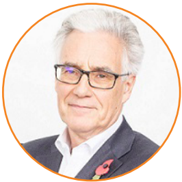
Adair Turner Chairman of the Energy Transitions Commission; Senior Fellow, Institute for New Economic Thinking (INET)

As Secretary-General of the Organisation of Economic Co-operation and Development (OECD) since 2006, Angel Gurría has firmly established the Organisation as a pillar of the global economic governance architecture including the G7, G20 and APEC, and a reference point in the design and implementation of better policies for better lives. He has broadened OECD's membership with the accession of Chile, Estonia, Israel, Latvia and Slovenia, and has made the Organisation more inclusive by strengthening its links with key emerging economies. Under his watch, the OECD is leading the effort to reform the international tax system, and to improve governance frameworks in anti-corruption and other fields. He has also heralded a new growth narrative that promotes the well-being of people, including women, gender and youth, and has scaled up the OECD contribution to the global agenda, including the Paris Agreement on Climate Change and the adoption of the Sustainable Development Goals.