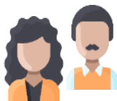
Figure 2: An example of fictional teacher personas

national evidence, will be used to demonstrate national characteristics. Each set will include a “future teacher persona”. Figure 2 shows one of the sample sets which will be adapted using overall (inter)national data and research.