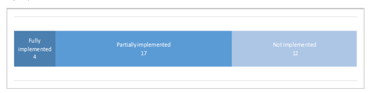
Figure 1. France's implementation of Phase 3 recommendations (as of the 2014 written follow-up report)

are systematically published on the OECD website. The last full evaluation of France – in Phase 3 – dates back to October 2012. The Working Group evaluated the implementation of its Phase 3 recommendations in 2014. During that evaluation, the Working Group concluded that 4 recommendations had been implemented, 17 were partially implemented and 12 were not implemented (Figure 1).