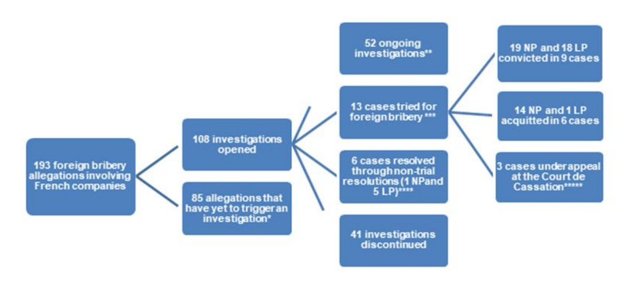
Figure 2. Foreign bribery cases since Phase 3 (September 2021)