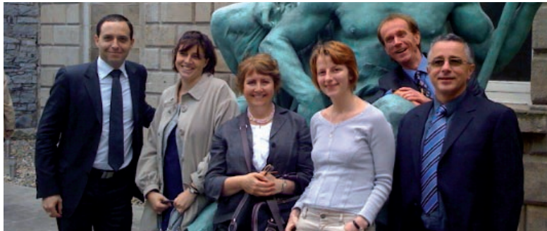
Examination Team for the Phase 2bis on-site visit to Ireland.