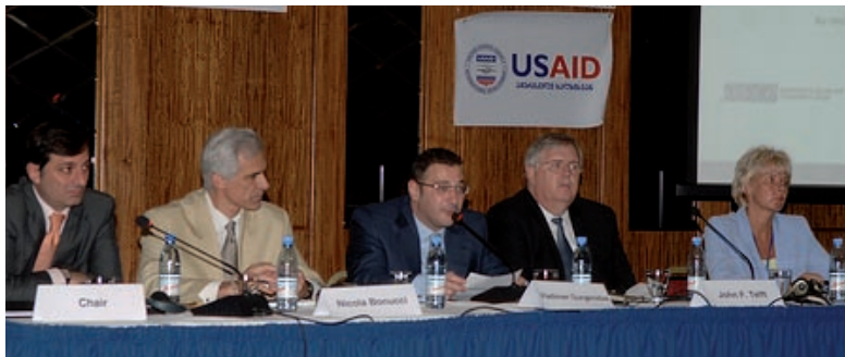
Opening session of the 7th General Meeting of the Anti-Corruption Network for Eastern Europe and Central Asia (ACN). Tbilisi, Georgia, 25 June 2008.

The Tbilisi meeting represented the first time that an ACN member country hosted the General Meeting, and participants were interested to hear about Georgia's significant progress in fighting corruption during recent years. Plenary and thematic sessions included: international anti-corruption instruments and related monitoring mechanisms;