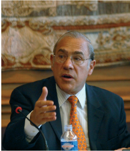
Angel Gurría Secretary-General

The OECD anti-corruption work is among the Organisation's most important achievements – and the OECD Anti-Bribery Convention is the centrepiece of these efforts. Throughout the world, people I meet ask me about our anti-corruption programmes, and I am proud to see the impact they are having in the OECD member countries and beyond.