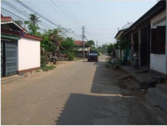
Photo A7.9: Village area improvement road at Si Boun Heung village