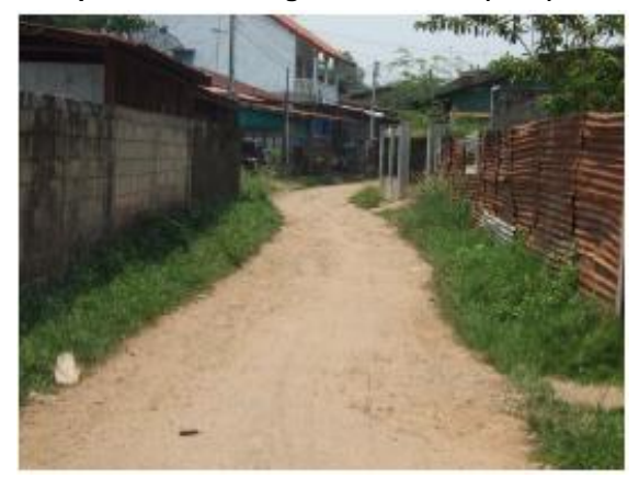
Photo A7.10: Village area improvement road at Phonsavanh Neua village