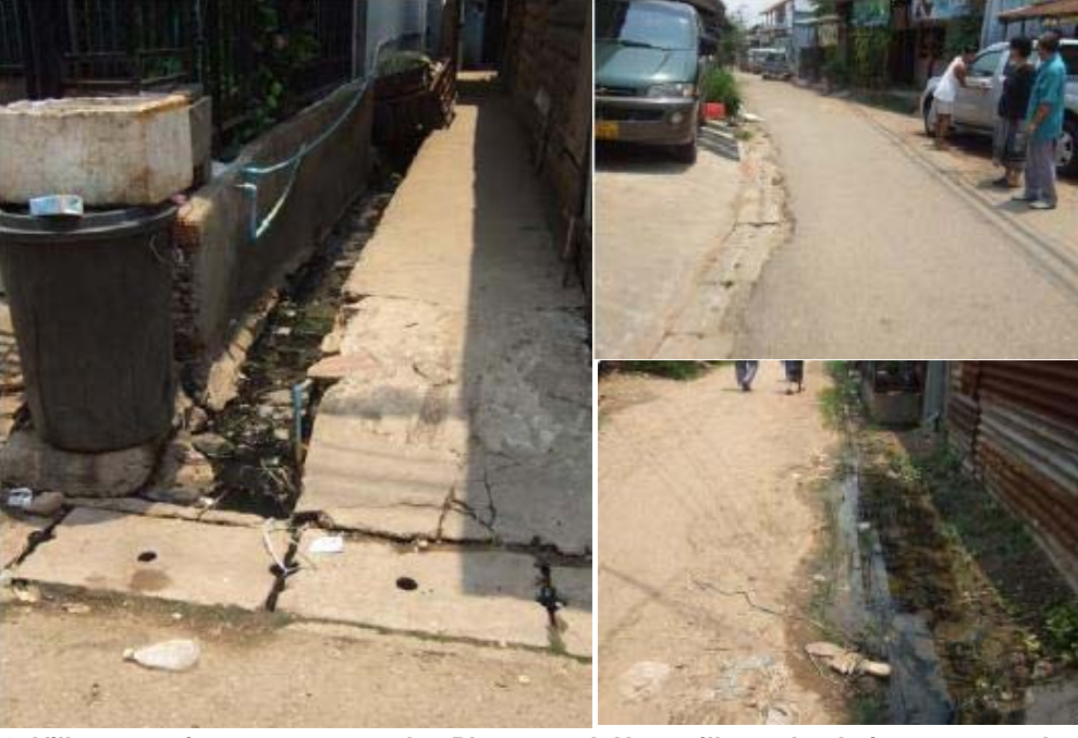
Photo A7.11: Village area improvement road at Phonsavanh Neua village; the drainage system has problems