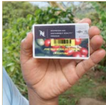
Farm database traceability

Originally, the name of the AAA Sustainable Quality™ Program derived from the AA standard, a hallmark of coffee quality found in Kenya and other high quality coffee origins. Nespresso added the third A to represent environmental, social and economic standards. Today, each A stands for the three foundations of our approach: ■ QUALITY ■ SUSTAINABILITY ■ PRODUCTIVITY