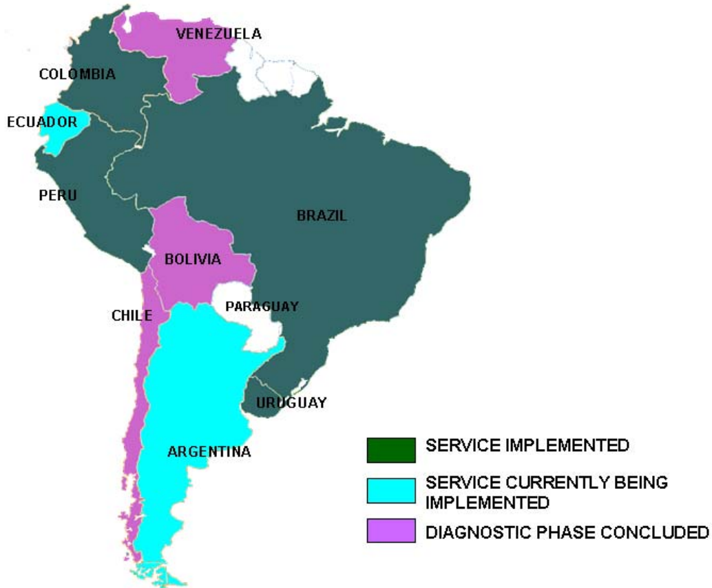
Graph 1: status of implementation of the project in South America

The Exporta Fácil service was launched progressively in Brazil from 2000 to 2002 while the service in Peru was launched in early 2008. The service is too recent in Colombia and Uruguay (2009-2010) to evaluate the first results. The first results in terms of exports volume have been extremely positive, as mentioned in graph 2 and 3 below.